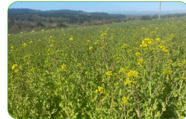
Figure 18: Flowering forage crops, not suitable for animals grazing.

Flowering forage crops cause a concern for animal health due to their SMCOs (anaemia causing compounds). If crops are flowering then animals should not graze them. Options in this scenario would be to top the flowers off with a topper, which would stop them eating the flowers. Another option would be to offer animals less e.g. 30% of their dry matter of the crop.