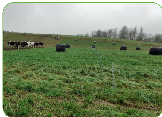
Figure 12: Bale grazing in practice at SRUC Barony Farm.

When the plastic was removed from the silage, a plastic disc was left on the bottom, which was collected when the fence and ring feeders were next moved.