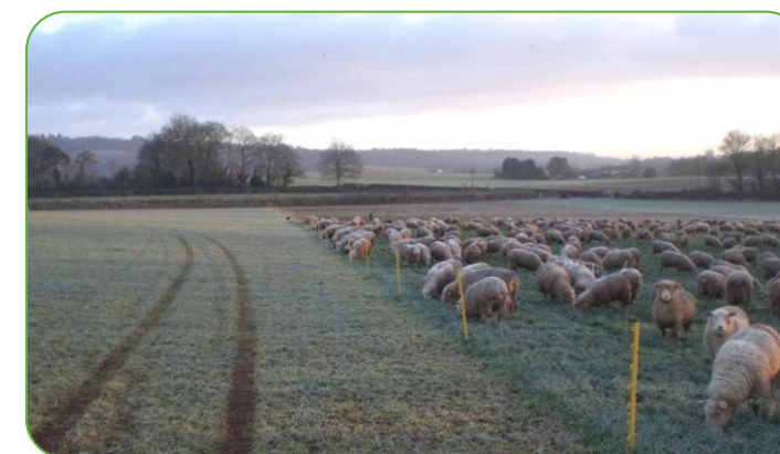
Figure 10: Sheep grazing in an All Grass Wintering System