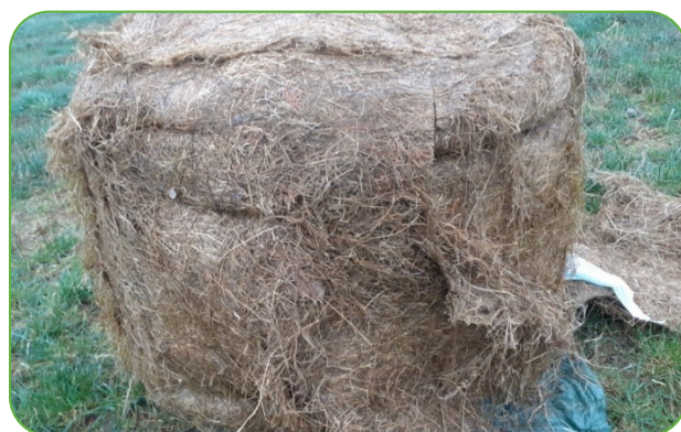
Figure 13: Bale with plastic removed.