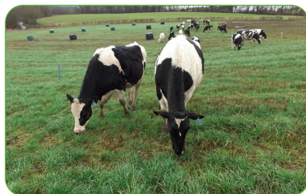
Picture 14: In calf heifers grazing the bale grazing at SRUC Barony Farm.