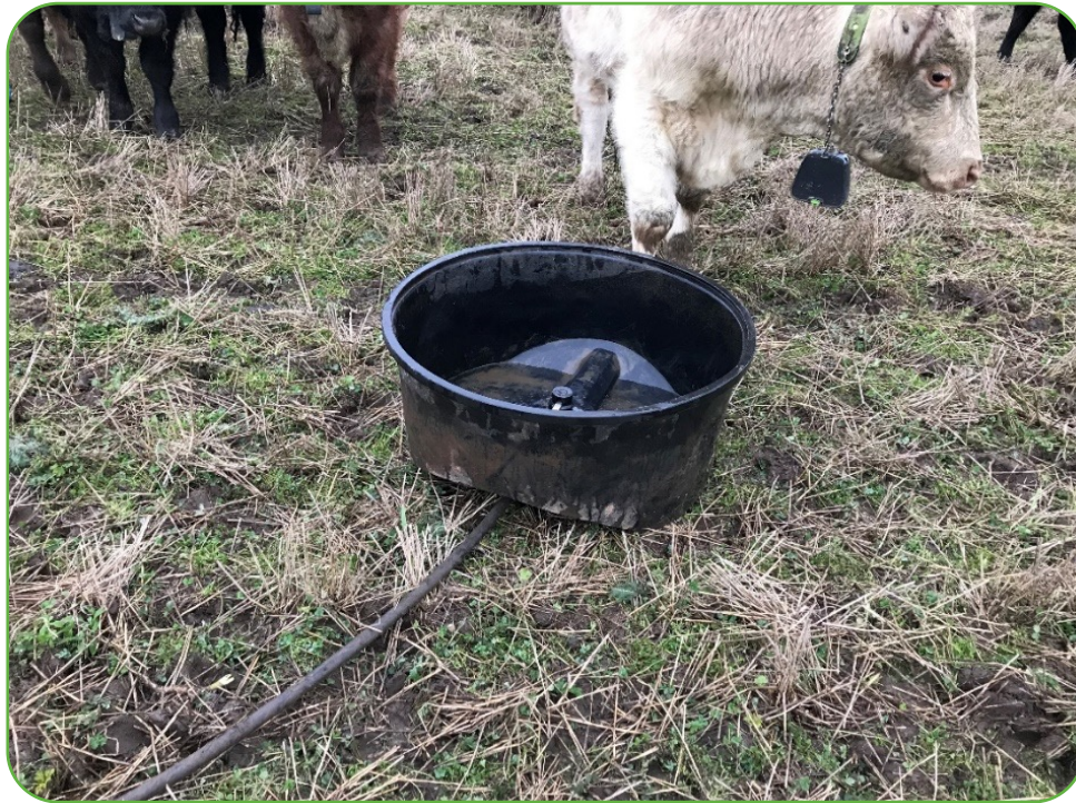
Figure 2: Bale grazing in Fife with a moveable water trough, which is emptied and dragged to next feeding area as required.

There are excellent materials available on the Farming and Water Scotland website to assist with alternative watering of livestock ( www.farmingandwaterscotland.org ).