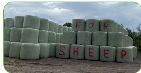
Figure 3: Analysed bales stacked showing highest quality for sheep.

Step 3: Place the bales at the edge of the field to align with the daily breaks when ground conditions are favourable. If using a ring feeder, have one or two in the field to be placed over the top of the bale after it is unwrapped. Avoid placing bales where poaching damage is most likely, e.g. at bottom of slopes.