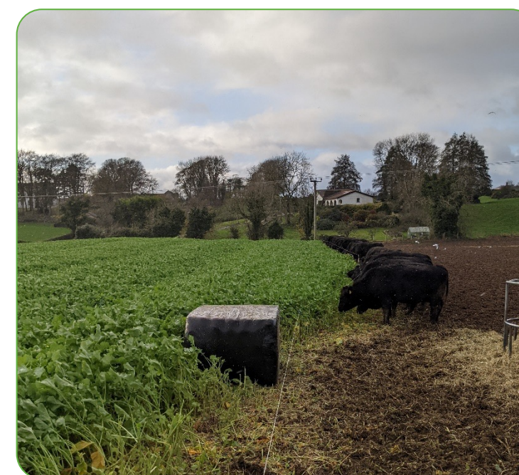
Figure 6: A long narrow electric fence to maximise forage crop utilisation.

Forage crops can be grazed in the field (in situ) or they can be harvested. When grazing in the field in situ, utilisation should be maximised to reduce wastage. This can be achieved by grazing the crop behind an electric wire. These should be long and narrow strips, which are moved frequently (cattle – daily), (sheep 3-4 days) to prevent trampling, reduce waste and allow for a balanced intake of protein and energy for the animals.