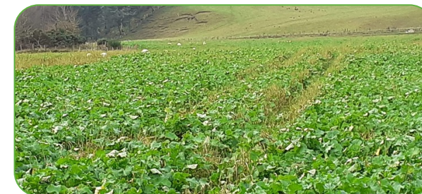
Figure 17: Catch crop stubble turnips at Easter Howgate September 2020.

In summer 2020, stubble turnips were broadcast into standing winter barley on the 28th July, 10 days prior to the crop being harvested as whole crop. The seed was broadcast over the standing crop, meaning there were no cultivations or disruption to the soil. The standing crop meant that all dew and rainfall created a damp microclimate in the seedbed for the catch crop. The barley was harvested on the 8th August, at which stage the stubble turnips were at cotyledon stage. Once the barley was removed, the stubble turnips grew quickly with the access of light.