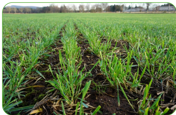
Photo 16: grazed winter wheat showing regrowth.

The producer found that both cereals grew away from the grazing. He used temporary electric fencing, powered by a battery to keep the sheep in as the arable fields are without permanent fencing. However, due to the awkward shape of some of the fields, occasional wooden posts were used to change the direction of the fence and keep the wires tight.