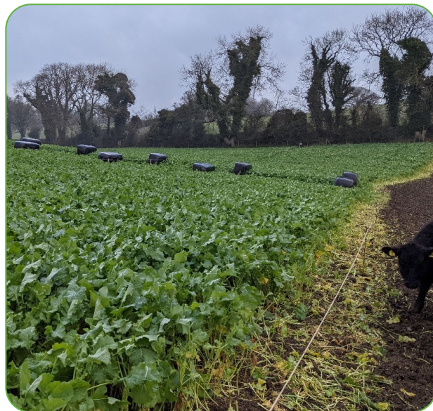
Figure 22: Use of two wires.

Tip 4: Using two wires placed forward, preventing break outs. If cattle get through to the next break they can't gorge/trample the whole field.