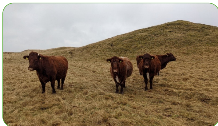
Figure 9: Dry suckler cows on deferred grazing

One method to acclimatise breeding stock, is to graze the hill areas with heifers in early summer so they can build up some immunity as youngsters before they are in calf. It is essential with outwintering cattle that there is a contingency plan if the winter conditions are particularly harsh e.g. prolonged snow in terms of additional feed being supplied to the cattle.