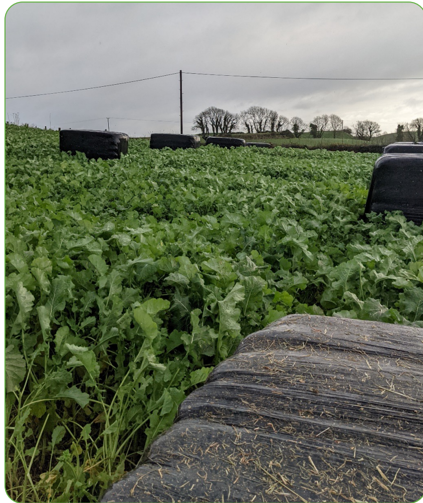
Figure 7: Bales set up in forage crop field.