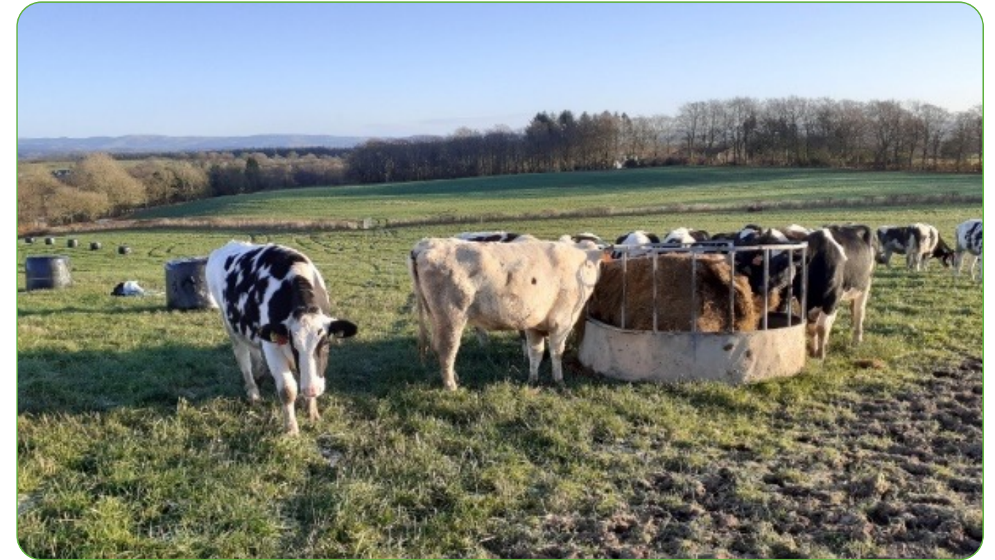
Figure 11: Bale grazing at SRUC Barony Farm.