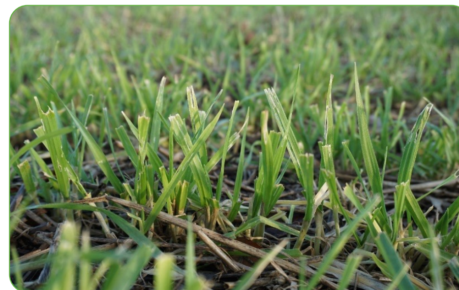
Photo 15: Grazed winter barley showing regrowth

The aim is to graze the crop while it is tillering (growth stage 21-29) and not into stem extension (growth stage 30), at which point there is a risk of reducing the yield through damage to the ear. The sheep can be grazed behind an electric wire on a paddock based system. It is important to monitor the grazing, and to move the sheep onto the next break when the required level of grazing has been carried out.