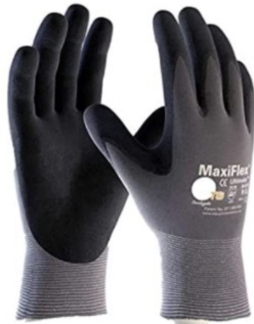
Figure 21: Insulated gloves

Tip 3: Use of electric insulated gloves allowing you to work with the electric fence and posts, offering a saving of time.