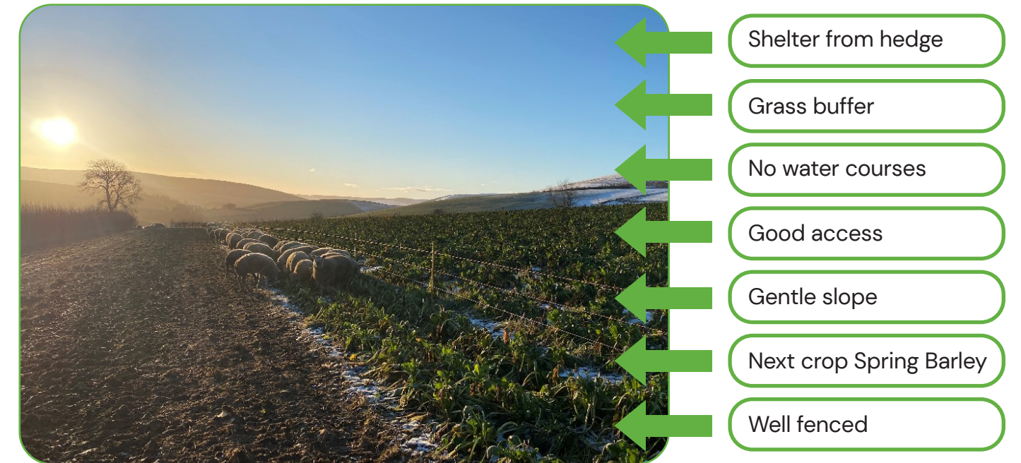
Figure 1: Overwintering field site showing key features when assessing a field for its suitability.

Not every option for outwintering is suitable for all farms and along with the system choice, field site is also important. Field sites on the farm should be chosen which meet the welfare needs of the animals and fulfill cross compliance requirements.