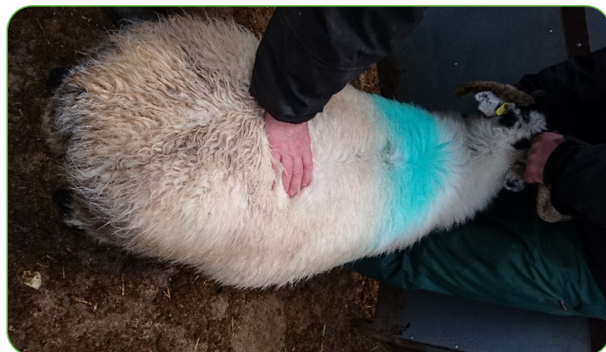
Figure 5: Condition scoring ewe.

Forage crops can be grazed by all ruminant stock classes. Animals should be condition scored prior to going on to a crop. Any leaner animals should be managed separately, until condition is regained. The condition of the stock should be monitored throughout the winter to ensure they are on target for their production cycle e.g. finishing lambs are gaining weight and suckler cows are maintaining weight.