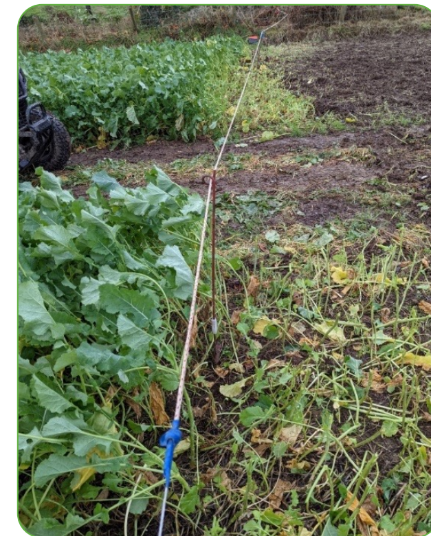
Figure 19: Electric wire on a bungy.

Tip 1: Use of bungy at the end of the wire makes moving the fence a one person job and saves letting the wire out and winding it back in. It allows you to easily lift the fence over the bales to the next break and the wire tightens back up.